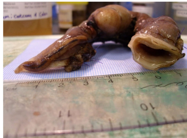
FIGURE 2 Photographs obtain of the ICC junction surgically removed by resection and anastomosis from a dog 5 days after endoscopy. The iatrogenic perforation is located on the mesenteric border of the colon adjacent to the ICC valve and is visible to the left and below the caecum. ICC, ileoceocolic

All animals immediately underwent exploratory midline celiotomy after diagnosis of ICC perforation. All perforations were adjacent to and within 3 cm of the ICC junction (Figure 2). Five dogs had an ileal perforation, with 3 on the mesenteric, 1 on the antimesenteric, and 1 between the mesenteric and antimesenteric borders. Four animals had colonic perforations located on the mesenteric border. Cecal perforation was identified in 4 dogs, affecting the mesenteric and antimesenteric borders in 1 dog each; the exact location of cecal perforation was not recorded for 2 dogs. Both cats had perforations on the antimesenteric border of the ileum and cecum. The approximate size of the perforation was recorded in 7 dogs and 1 cat. The median size of the perforation in animals diagnosed immediately was 7.5 mm (range, 1-10 mm; n = 6 ), versus 1 and 5 mm in 2 dogs with delayed diagnoses. The putative source of the perforation was recorded in 11 cases as follows: endoscope tip (5 dogs), forceps-induced trauma (3 dogs, 2 cats), repetitive ileal biopsy (1 dog). The perforation site was directly closed in 7 dogs and 1 cat, whereas 5 dogs had ICC resection and anastomoses performed; the closure technique was not documented in 1 dog and 1 cat.