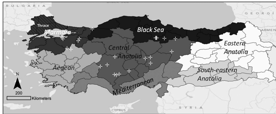
Figure 1. Map of Turkey. The locations of the 23 villages included in the prospective serological field survey used to inform the model in this study are marked with crosses 8 . The hashed lines show the FMD-free with vaccination zone of Thrace. Turkey consists of seven regions, divided into 81 provinces and 957 districts, containing about 48,000 villages. Created using ArcGIS ® software by Esri (ArcMAP10.3).

We previously assessed immune response in Turkish cattle after routine FMD vaccination under field conditions 8 . However, that study only assessed a small subgroup of the vaccinated population and did not take into account age structure of the population at large and population turnover. In addition, the vaccine history of those sampled did not reflect that of the population at large.