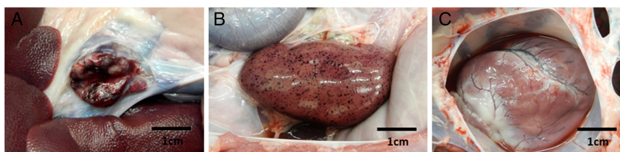
Figure 1 Macroscopic lesions observed in organs of domestic pigs infected with the Georgia 2007/1 ASFV strain. A) Enlarged and haemorrhagic hepatogastric lymph node from a between-pen contact pig terminated at 11 days post exposure. B) Multifocal cortical haemorrhages (petechiae) on kidney from an inoculated pig terminated at 8 days post-inoculation. C) Fluid in pericardial cavity (hydropericardium) from a within-pen contact pig terminated at 12 days post-exposure.

signs and virus shedding were compared per group using a t-test. The type of post-mortem lesions were compared between groups using a one-way ANOVA test. The values of clinical scores and viral shedding were compared between groups in relation to time using a linear mixed effect model. All statistical analyses and plots were performed using the R statistical program [20]. The packages “epi.studysize”, “lme4”, “lmerTest”, “latticeExtra” and p < 0.05 were used to indicate statistical significance.