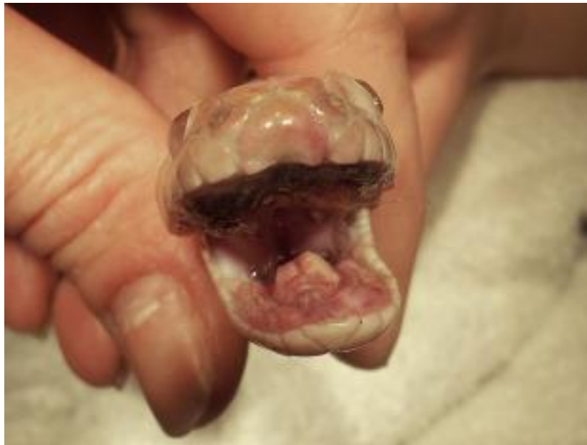
Figure 8. Mycobacterial lesions can present as chronic granulomas as seen in this Red-tailed boa ( Boa constrictor ).