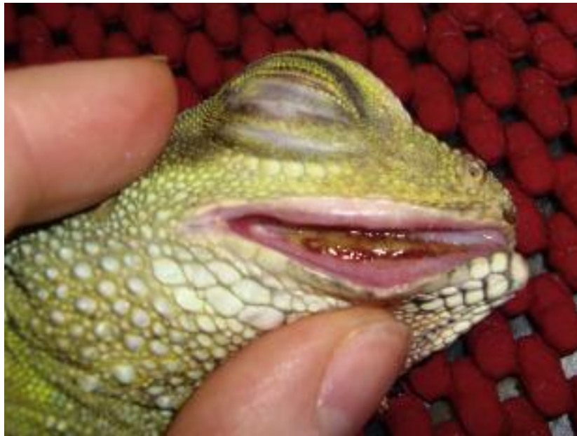
Figure 12. Deformities of the facial bones are a common consequence of nutritional secondary hyperparathyroidism, as seen in this Bearded dragon ( Pogona vitticeps ) which is unable to close its mouth.