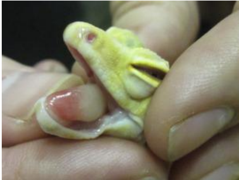
Figure 14. Rostral abrasions and secondary infection in a Chinese Water dragon ( Physignathus cocincinus ).